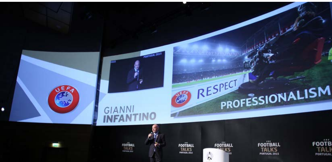
Gianni Infantino / General Secretary UEFA