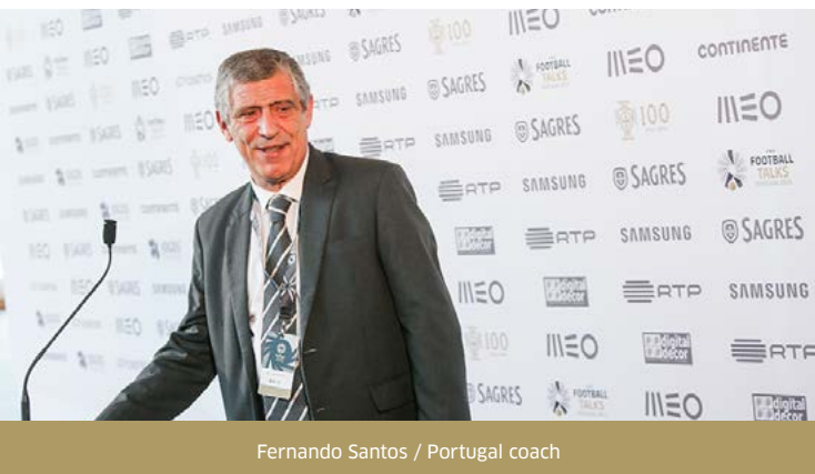
Fernando Santos / Portugal coach

Footballers, coaches, directors, academics, journalists, students of football social impact and fans - all, were fascinated by the ideas transmitted by speakers such as Gianni Infantino, Pierluigi Collina, Emilio Butragueño and Gérard Houllier, to mention just a few of the biggest names who were present at Estoril.