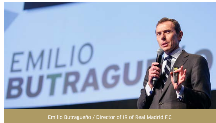
Emilio Butragueño / Director of IR of Real Madrid F.C.